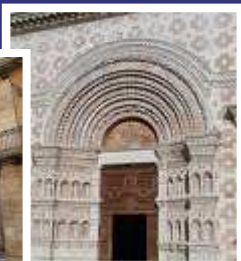
Chiesa di Collemaggio (L'Aquila)