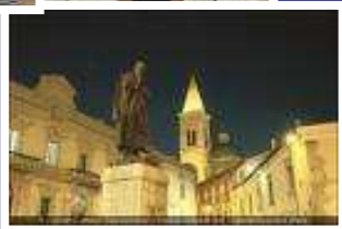
Ovidio Statue (Sulmona)

... A maze of narrow streets lined with baroque or renaissance buildings and churches, opening onto elegant piazzas, home the location on the FNMA09 Conference in Palazzo dell'Annunziata in Sulmona-L'Aquila.